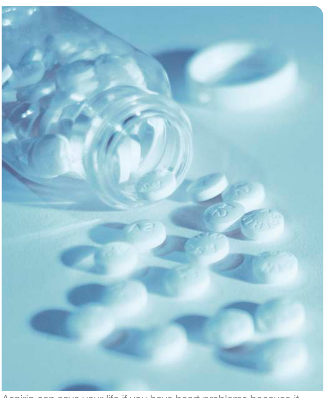
Aspirin can save your life if you have heart problems because it helps keep blood from clotting.