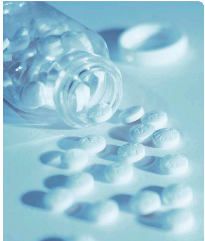
Aspirin can save your life if you have heart problems because it helps keep blood from clotting.